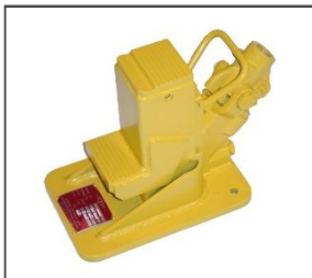
Zwicky B805 Toe Jack