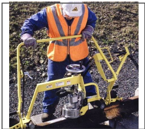
02100 Profile Grinder