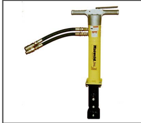
No 01100 Spike Extractor