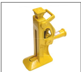
Duff Norton 117A Trip Jack