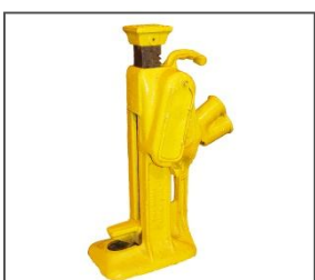
Duff Norton 516MT Ratchet Jack