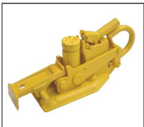
Stumec CH65 Slewing Jack